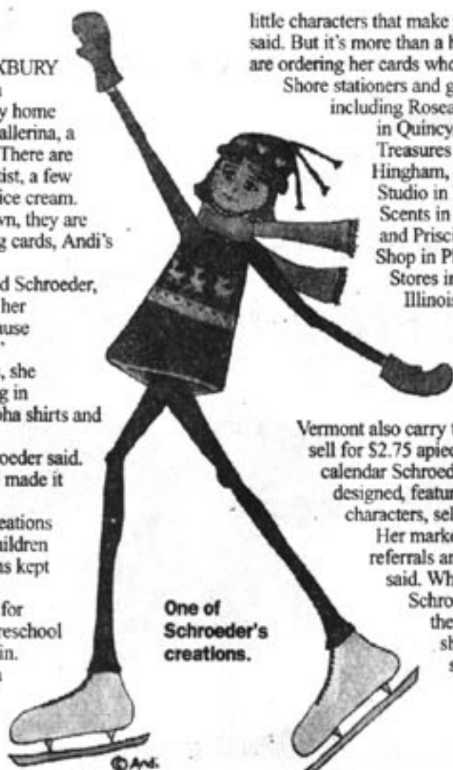
One of Schroeder's creations.

little characters that make you smile," Schroeder said. But it's more than a hobby. Thirty-six stores are ordering her cards wholesale. Several South Shore stationers and gift shops sell the line,